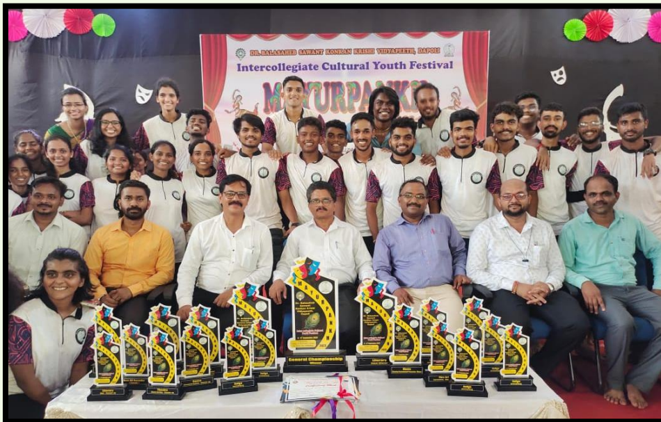
Winner- General Championship in Intercollegiate Youth Festival (Mayurpankh- 2023)