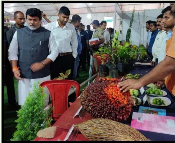
Participated in Agril. Exhibition