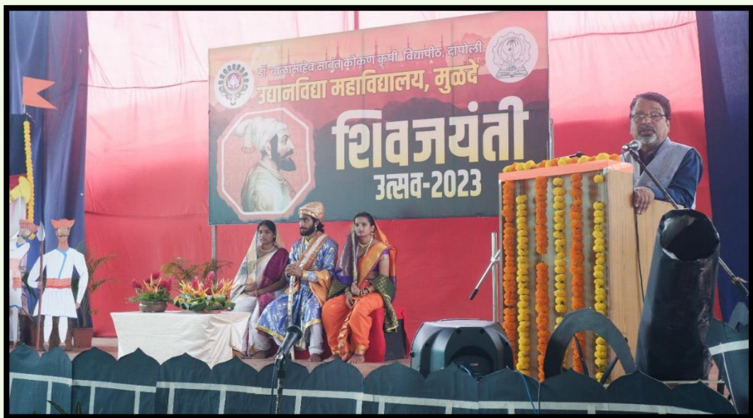
Celebration of Shivjayanti