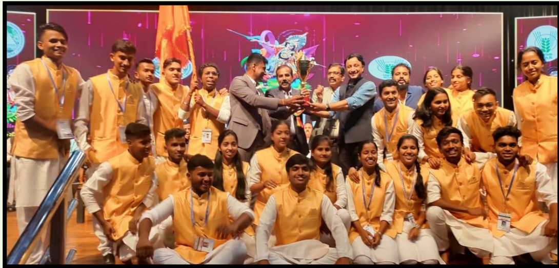
General Championship in Theatre event in Youth festival (ICAR) 2022-2023 held at Bangalore on 18.03.2023