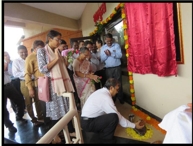
Girls' hostel- 'Vasundhara'