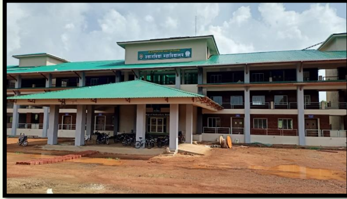
College of Horticulture, Mulde- New Building