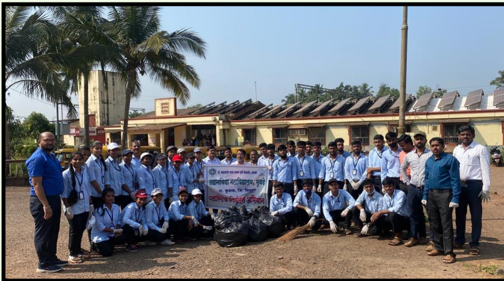
Campaign on plastic eradication at Kudal, Sawantwadi and Kankavali