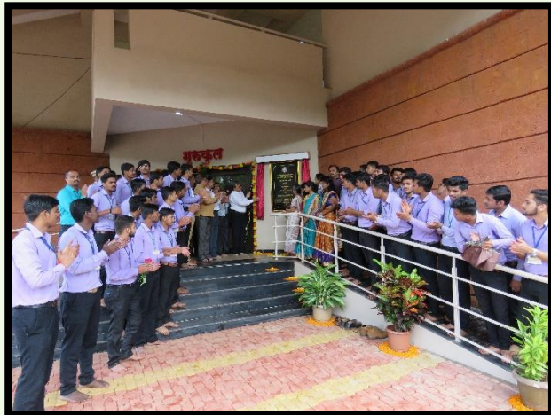
Boys Hostel- 'Gurukul'