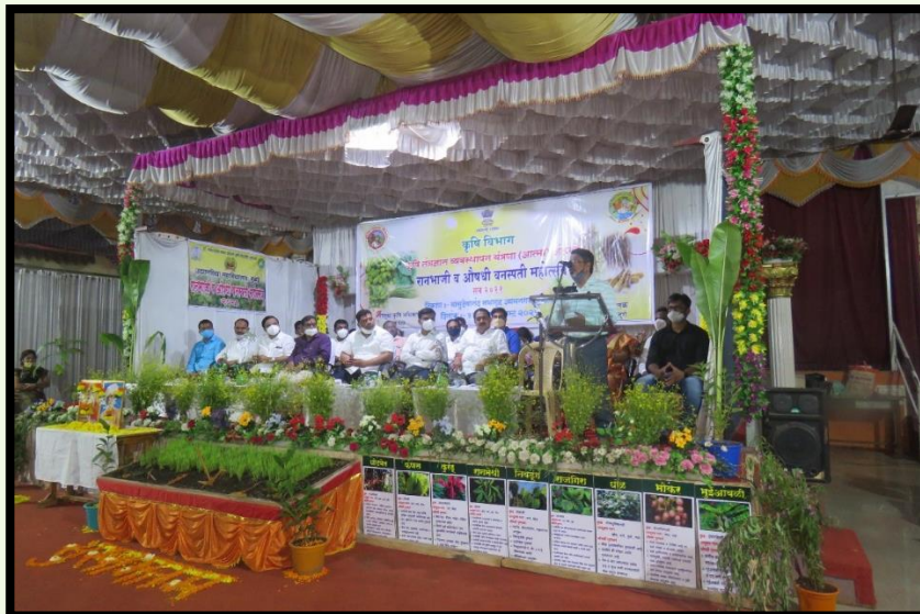
Organization of Wild and Medicinal vegetable festival with Department of Agriculture, Maharashtra Govt.