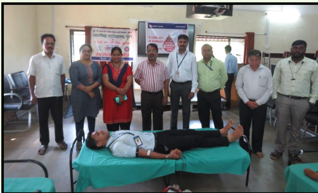
Organization of Blood Donation Camp