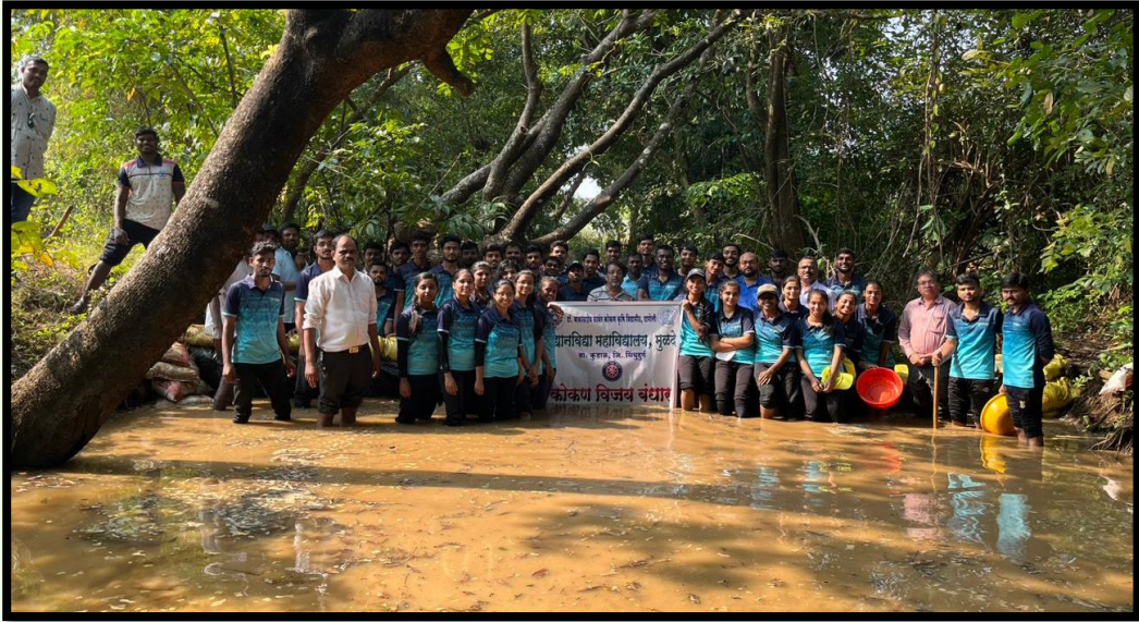
Construction of “Vanrai Bandhara”