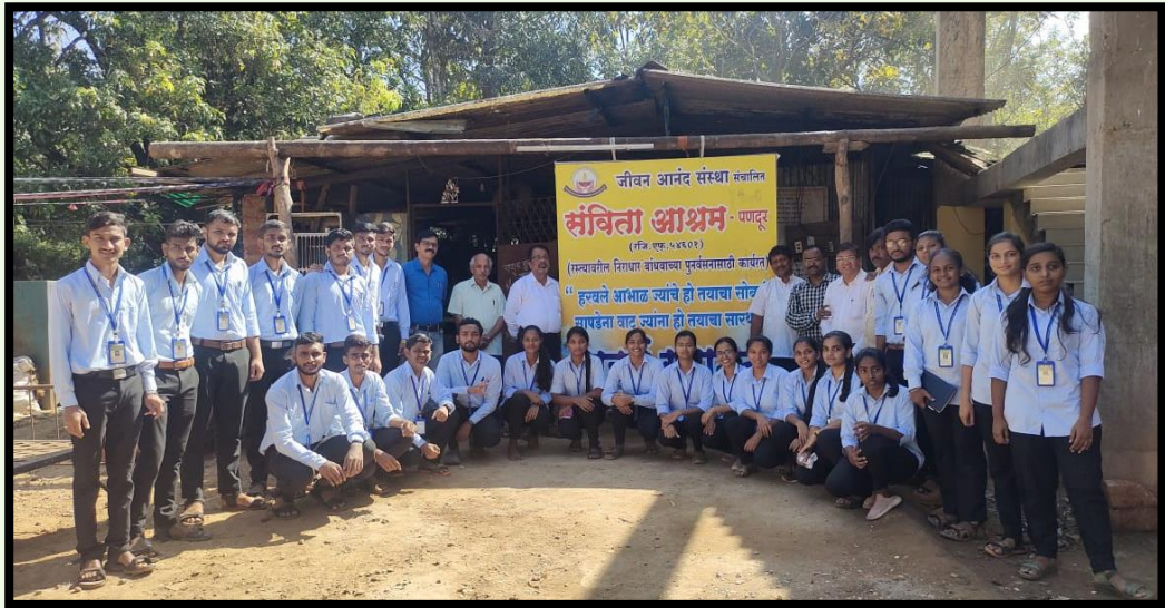
Visit to Old age home