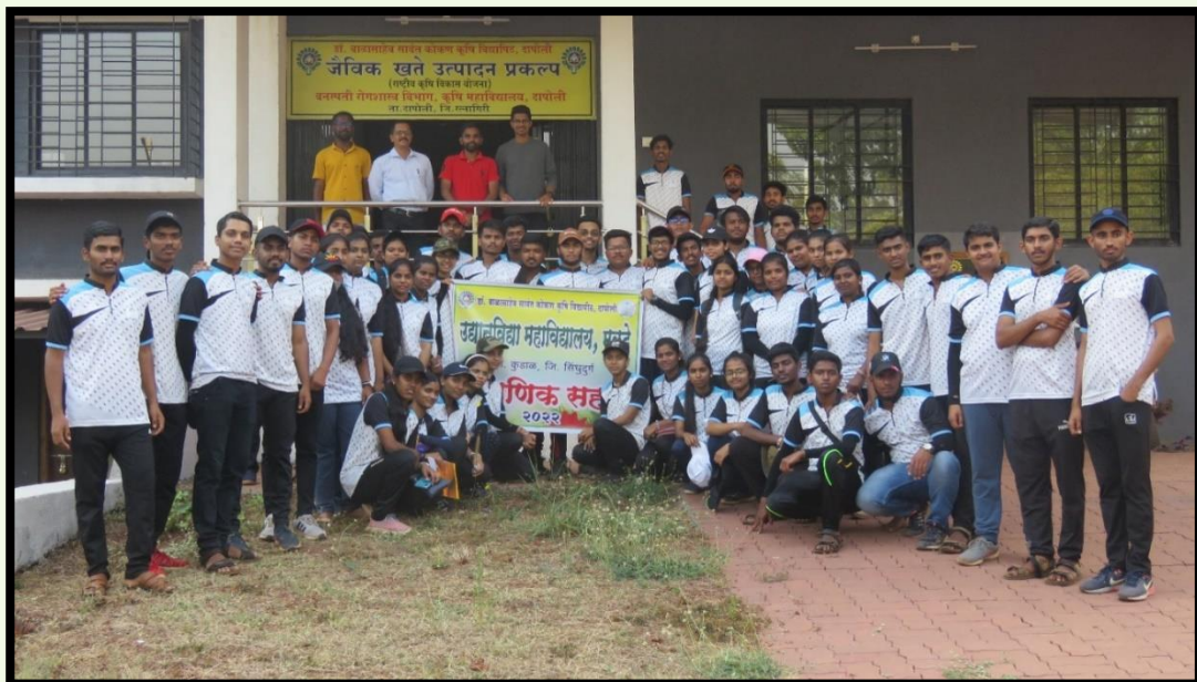
Organization of Educational Tour