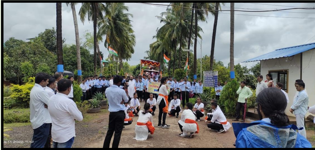
Celebration of Azadi ka Amrut mahotsav