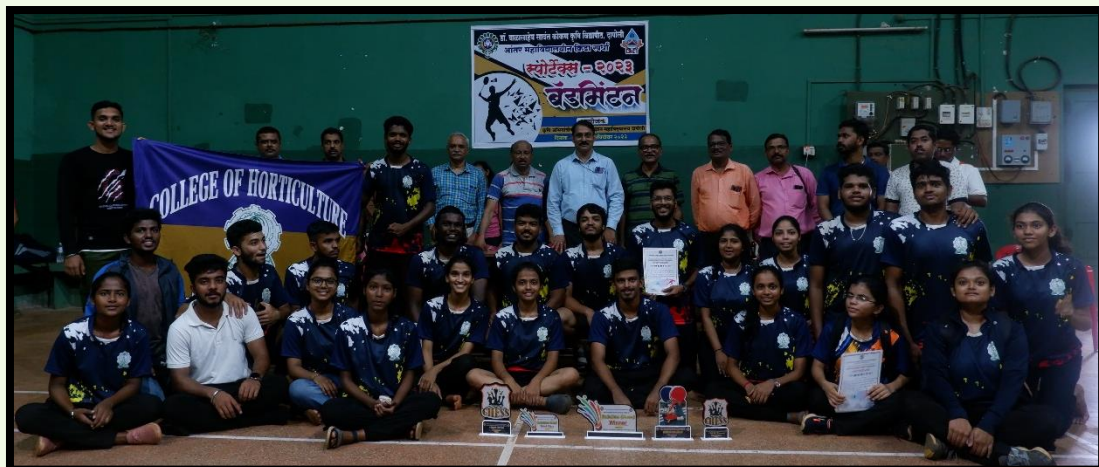
Intercollegiate Sports Competition (Sportex- 2023)